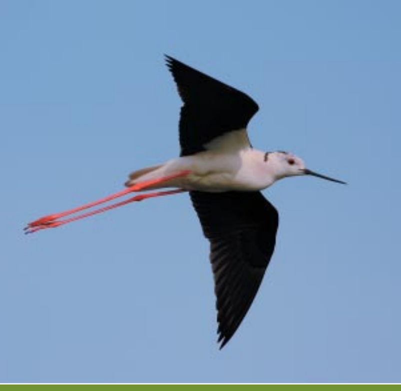
WOW's Critical Site Network tool identifies distinct populations of species like Black-winged Stilt Himantopus himantopus (above) and Bittern Botaurus stellaris (below), and the different flyways and sites they use (Simay Gábor)